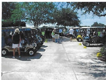
We got organized for our first outing held September 19, 2011