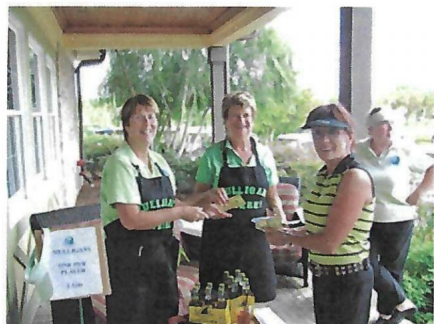
We sold mulligans