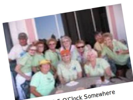
Sept. 9 5 O'Clock Somewhere