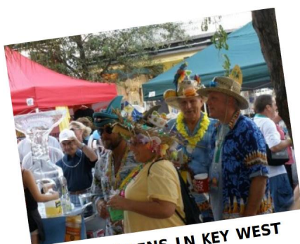
WHAT HAPPENS IN KEY WEST STAYS IN KEY WEST

It is approximately 1 mile from Southernmost on Duval St. to the other end. There are vans, but plan on doing a lot of walking.