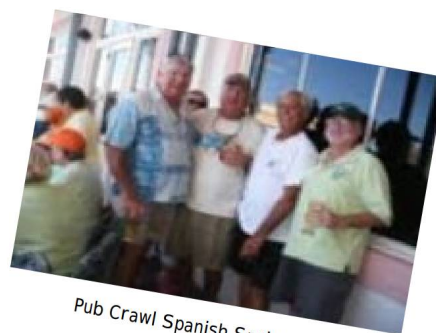
Pub Crawl Spanish Springs

This is the final scheduled 5 O'Clock Somewhere this year.