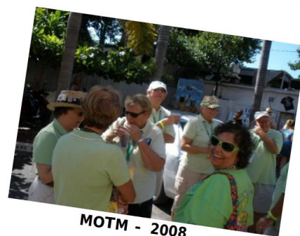
MOTM - 2008

Also, remember to take a bag chair (allowed this year on the beach only), booze & snacks for your room, jacket or sweatshirt, jeans (it can get chilly at night), and walking shoes.