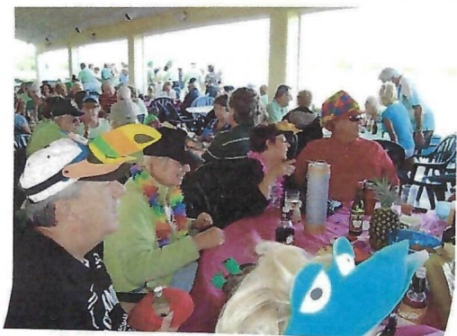
2009 Parrot Head Anniversary Party at the Polo Field