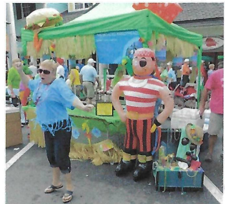
Cheeseburger 'N' Paradise