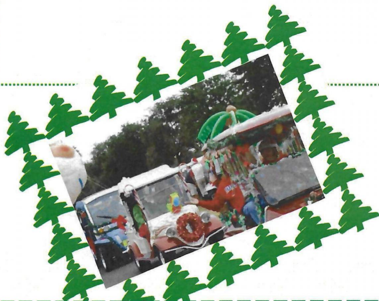
2009 Christmas Parade

For the past several years The Villages Parrot Heads Club members have gotten a group together and rode around The Villages to look at Christmas Lights. There are some spectacular homes each year. The number of members enjoying this evening has grown every year. So, this year we will be doing two groups. One North of 466 and one South of 466. Both groups will go out on December 7th at the same time and then meet up to enjoy a few cocktails and possibly dinner at R.J. Gators in Sumter Landing.