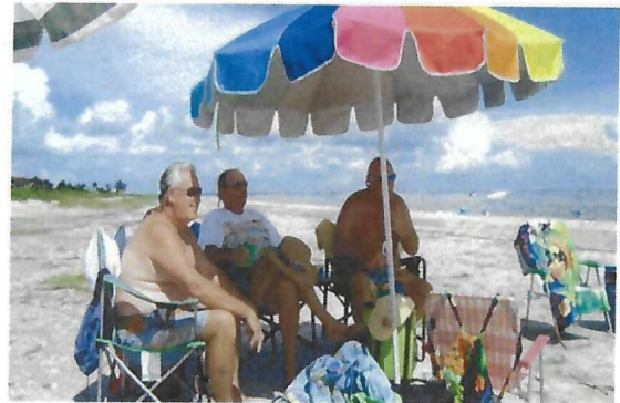
Village Parrot Heads relaxing on the beach at Sanibel Island, 2009